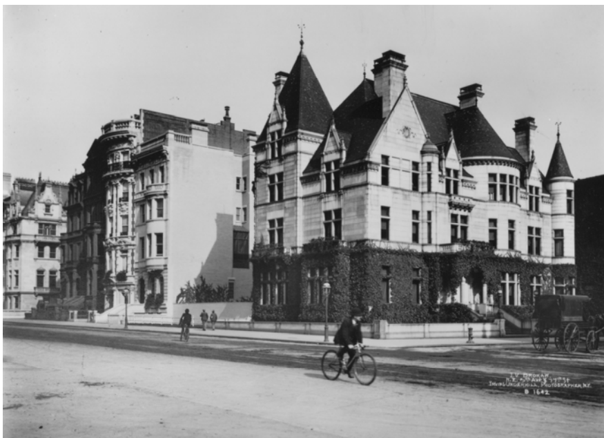
Figure 8. The Isaac Brokaw Mansion, 5th Avenue and 79th Street, New York City. Undated. The mansion was razed in 1965 in favor of a 25-story apartment building. Courtesy of the Museum of the City of New York. The Underhill Collection. B.1642.

The Brokaw decision was widely condemned by leading law professors of the day, especially those influenced by the Realist movement. 127 It was decried as rigid and unreasonable, an impediment to progress. 128 A blue-ribbon panel of law reformers, the New York Law Revision Commission, recommended that the decision be overturned by the New York legislature. 129 The commission's idea of a sound approach to the law was the Wisconsin Supreme Court's decision in Melms . 130 The commission proposed a five-part test for determining whether an action is waste, including whether the area has experienced changed circumstances and whether the modification would enhance the value of