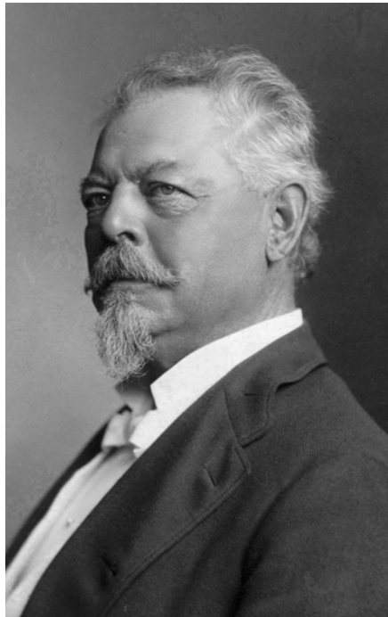
Figure 4. Frederick Pabst.