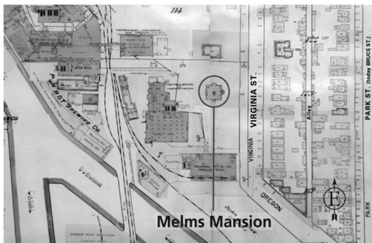
Figure 6. This map, primarily taken from Rascher's Fire Insurance Atlas of the City of Milwaukee (1876 as updated 1885) and combined with the 1888 Rascher's , depicts the Melms mansion and vicinity at the time of the 1891–1892 teardown. Note the neighborhood of houses on the other side of Virginia St. and continuing south toward Park St. (and farther south beyond the margin of this excerpted image).