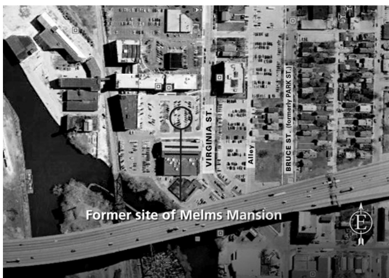
Figure 7. This modern aerial view shows the site today. Note the houses on Bruce St. (formerly Park St.) and continuing to the south.