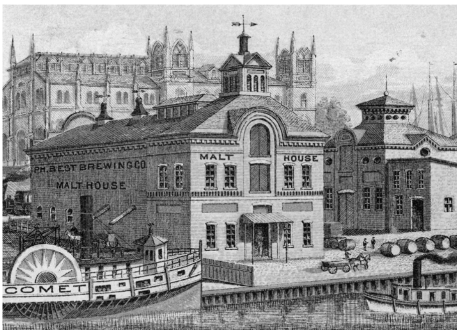
Figure 5. Phillip Best Brewing Co.'s "South Side Brewery" along the Menomonee Canal, ca. 1880 (old Melms brewery in the background).